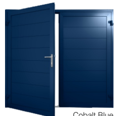
Cobalt Blue RAL 5013