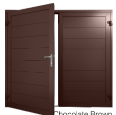
Chocolate Brown RAL 8017