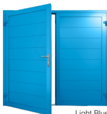
Light Blue RAL 5012