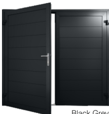
Black Grey RAL 7021