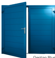
Gentian Blue RAL 5010