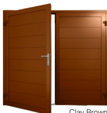
Clay Brown RAL 8003