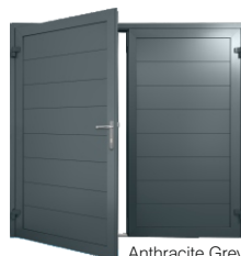
Anthracite Grey RAL 7016