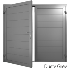
Dusty Grey RAL 7037