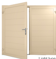
Light Ivory RAL 1015