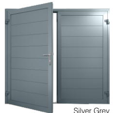
Silver Grey RAL 7001