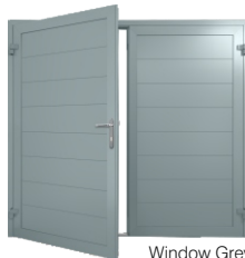
Window Grey RAL