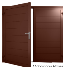
Mahogany Brown RAL 8016