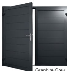
Graphite Grey RAL 7024