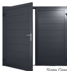
Slate Grey RAL 7015