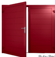
Ruby Red RAL 3003