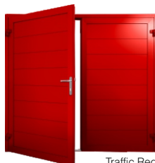
Traffic Red RAL 3020