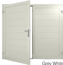
Grey White RAL 9002