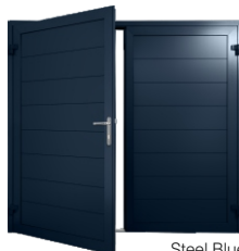
Steel Blue RAL 5011