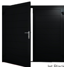
Jet Black RAL 9005