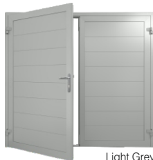
Light Grey RAL 7035