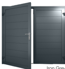
Iron Grey RAL 7011