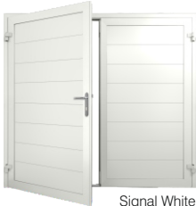
Signal White RAL 9003

lasting beauty, and all doors feature colour-matched hinges for a seamless look.