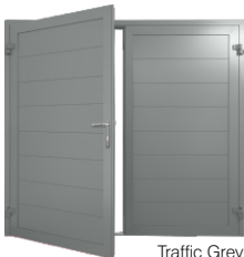
Traffic Grey RAL 7042