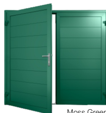
Moss Green RAL 6005