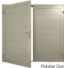
Pebble Grey RAL 7032