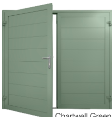
Chartwell Green BS 14 C 35